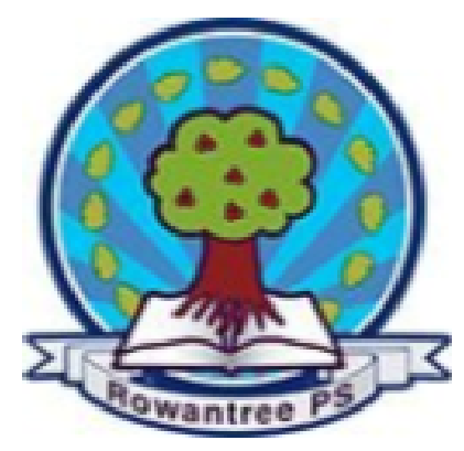
Rowantree Primary School

Safeguarding: Children and Families Service Code of Good Practice